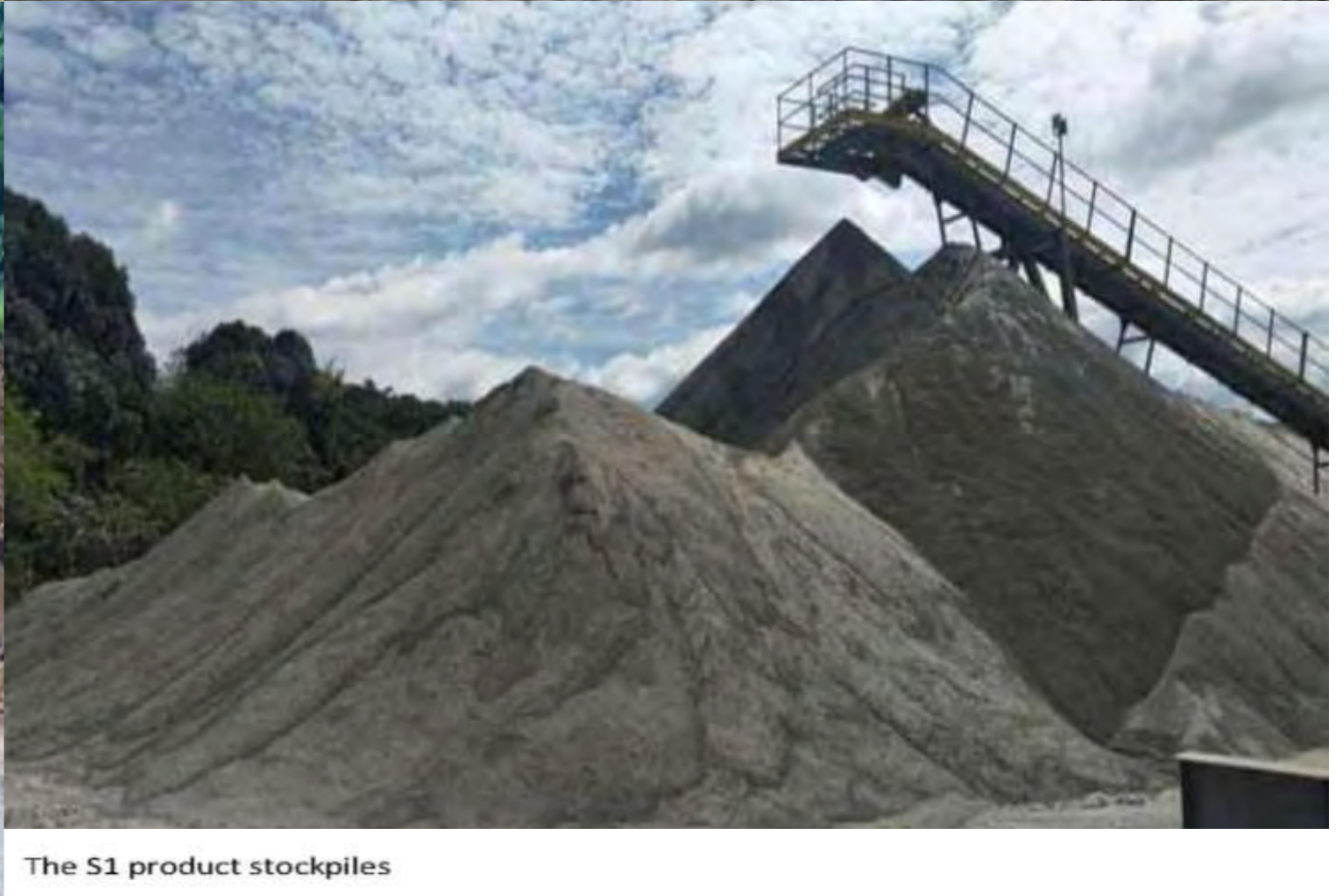
The S1 product stockpiles