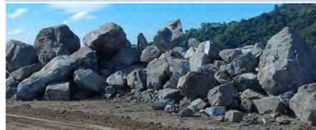
Armour Rock Boulders